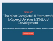
Learn More About Kendo UI