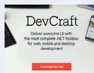
Learn More About DevCraft