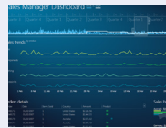
UI for WPF in Action