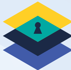
Flowmon Threat Intelligence