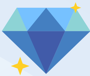
Upgrades and Updates

Flowmon Standard and Extended Support are comprehensive services to provide customers with full support for their Flowmon solution. With Standard Support, you get automated access to updates and upgrades , fast system support, extended hardware warranty onsite hardware repair. Extended Support extends Standard Support with other premium services. Your Flowmon solution keeps the highest possible performance and you maximize your investment.