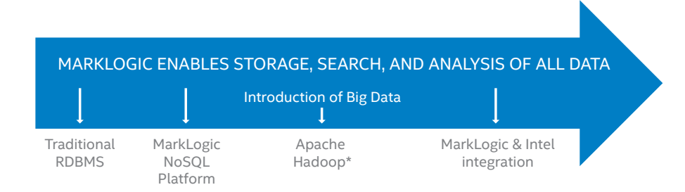
Figure 5. MarkLogic enables 'Big Data' before Big Data