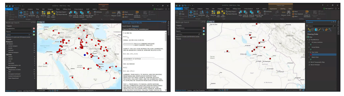
Figure 1. Perform complex searches against unstructured content

The Esri ArcGIS Pro has baseline capabilities that are enriched with near real-time search functionality powered by full-text query entry and easy-to-use faceted navigation UI enhancements using the MarkLogic Add-in for ArcGIS Pro. Complex searches against unstructured content can then be visualized as feature layers to provide deeper context to geospatial content.