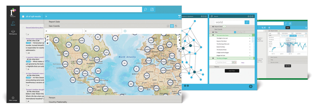
Screenshots of the Berico Rivium application, powered by the Geo360 solution platform

The MarkLogic Geo360 solution delivers an accurate representation of the real world, increased trust and security, as well as significantly decreased TCO of geospatial systems by combining file servers that store information about features and the geospatial system, and allowing analysts to directly capture and relate their geographic knowledge on one platform. It supports integration with industry standard user interfaces such as Esri ArcGIS*, OpenGeo Suite, Berico Rivium*, OGC-compliant GIS tools and SPARQL-compliant semantic visualization tools.