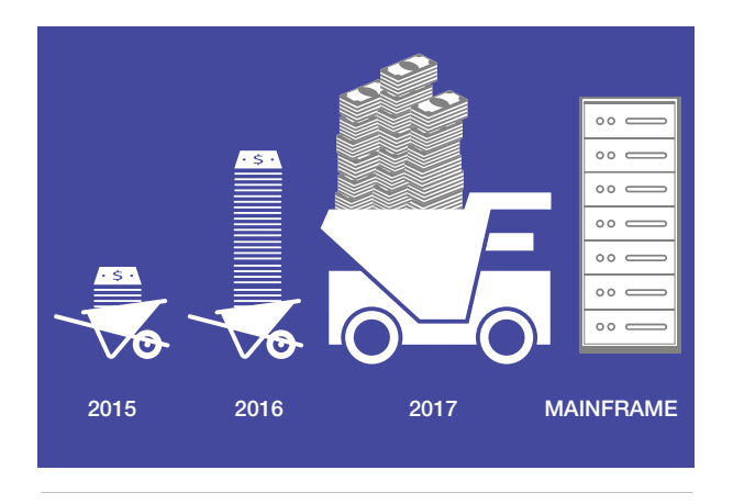
As an organization's legacy system ages and widespread use of mainframe technology fades further into history, it will cost more and more to maintain the same level of service.

Future opportunity can be hard to quantify, but current costs are a serious and measurable issue. While there is a short-term cost to adopting a new technology capable of flexible and creative data implementation, the status quo will be increasingly more expensive. The maintenance of a legacy mainframe is becoming costlier by the year.