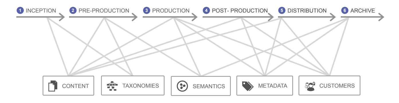
Figure 1: Without MarkLogic, siloed systems are slow and expensive to integrate