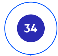
Employee Net Promoter Score (eNPS)