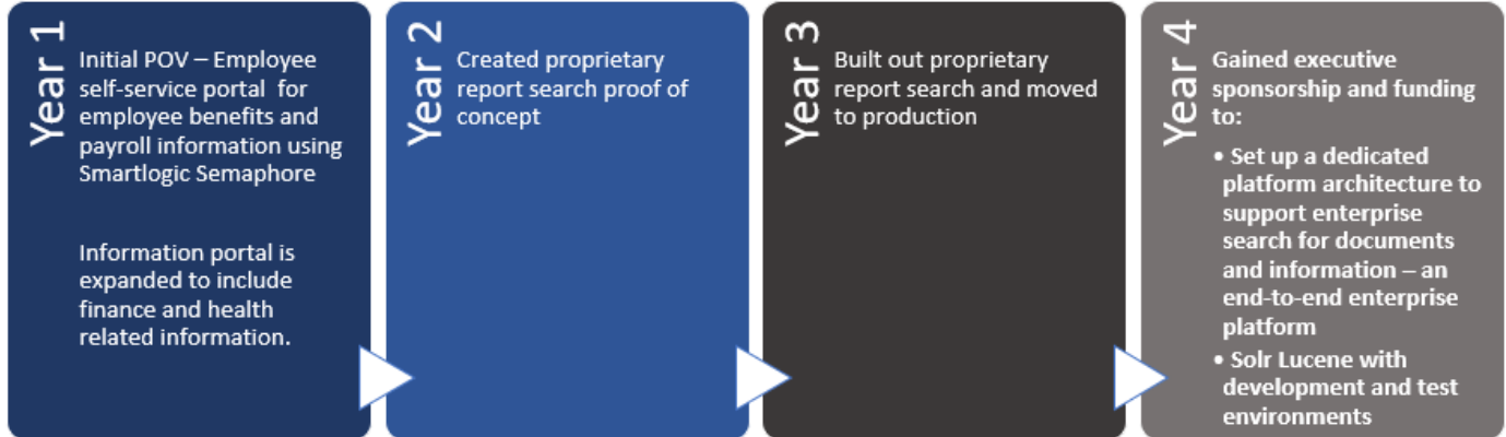
Figure 1. Application evolution from simple portal links to an enterprise search platform powered by Semaphore.